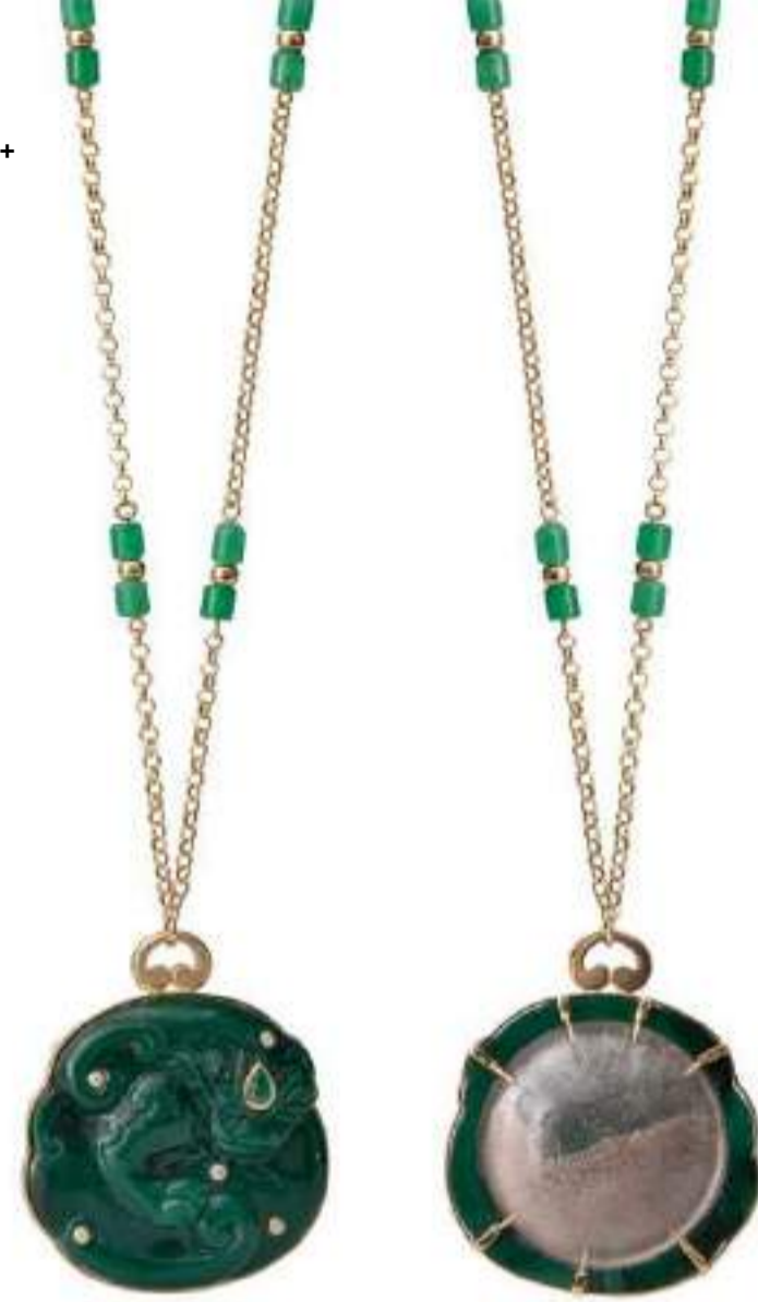
Silvia Furmanovich | @silviafurmanovich