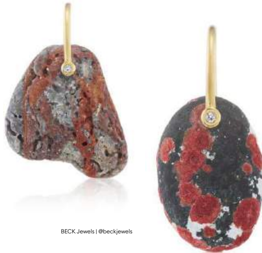
BECK Jewels | @beckjewels