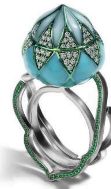
Candy & Co | @candyandcojewelry