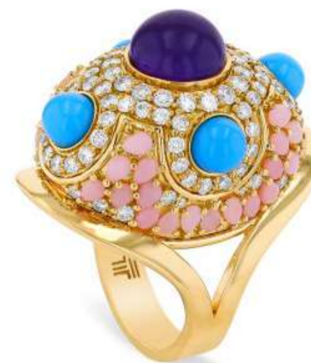
Toktam | @toktam.jewelry