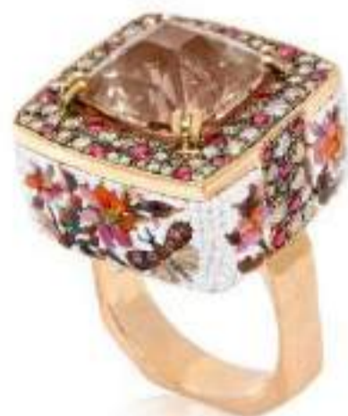
Le Sibille | @lesibille