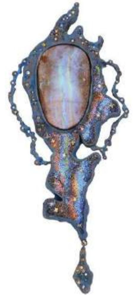
Le Sibille | @lesibille