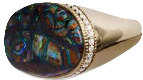
Jacque Aiche | @jacqueaiche