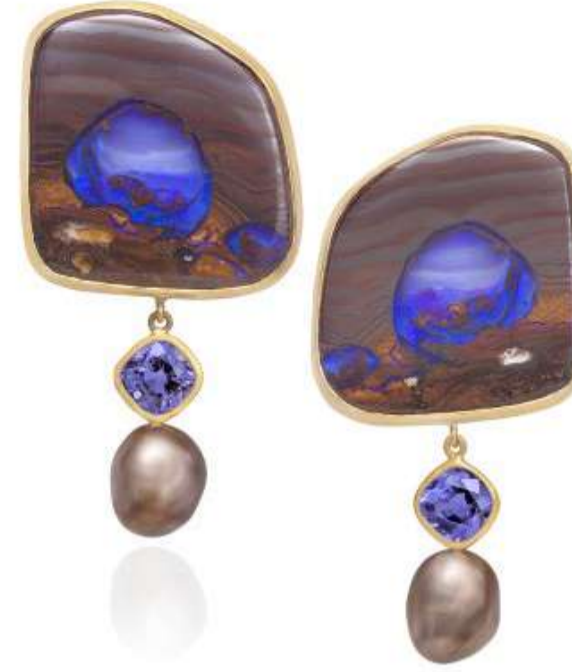
Assael | @assaelpearls