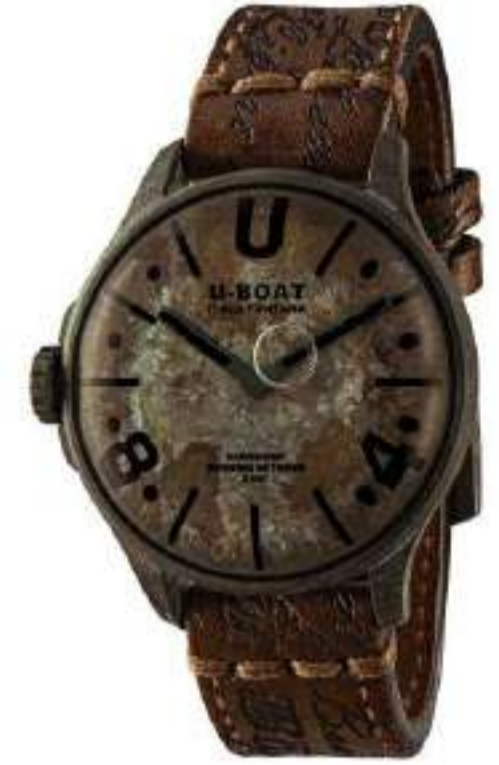
U-BOAT Italo Fontana | @uboatwatch_official