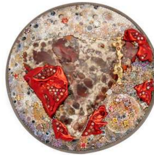
Le Sibille | @lesibille