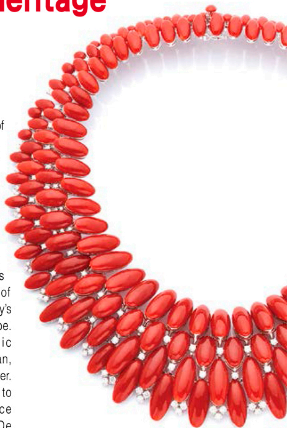
ICON COLLECTION NECKLACE SET WITH AKA CORAL AND DIAMONDS FROM DE SIMONE DE SIMONE的「ICON系列」AKA珊瑚及鑽石鑲嵌項鍊

"Coral is considered the world's unique jewel that carries multi-faceted values. One of the aspects is that coral has a biological life before it is crafted into jewellery. It is the embodiment of