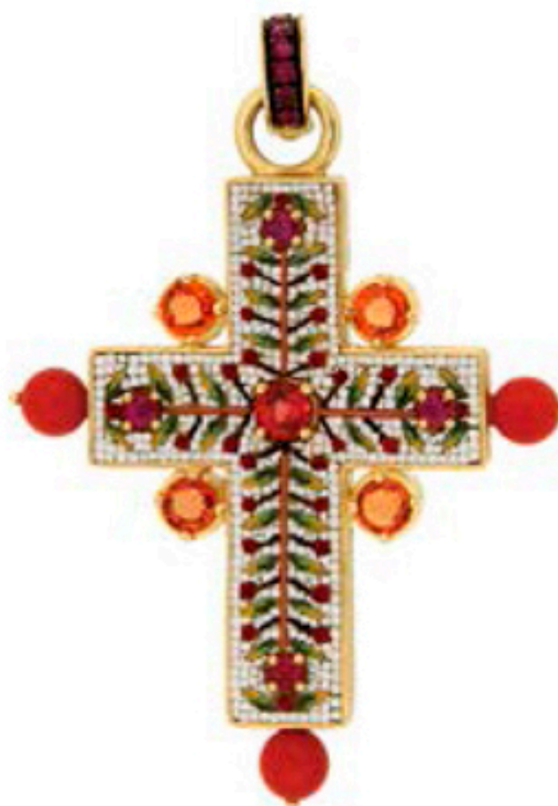
POMPEI CROSS PENDANT SET WITH 18-KARAT GOLD, CORAL, RUBY, ORANGE SAPPHIRE AND MICROMOSAIC FROM LE SIBILLE LE SIBILLE的鑲嵌18K金、珊瑚、橙色剛玉、紅寶石及MICROMOSAIC「POMPEI」十字架吊墜

To bring more awareness to the features of Italian coral jewellery, Assocoral has organised events and projects which focus on the protection of coral, quality certifications, and the