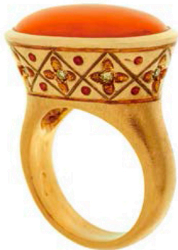
TODRA RING SET WITH 18-KARAT GOLD, CORAL, BROWN DIAMONDS AND ENAMEL FROM LE SIBILLE LE SIBILLE的鑲嵌18K金、珊瑚、啡鑽及珐瑯「TODRA」指環

為重現典型文藝復興時期工作坊的精神和本質，三位來自意大利的年輕女士創立了 Le Sibille srl 。他們由意大利不同歷史時期多樣風格的工匠技藝中汲取靈感，探索源自18世紀對古老馬賽克工藝進行革新的羅馬微鑲馬賽克（Roman Minute Mosaic）技術。其中「The Micromosaic」