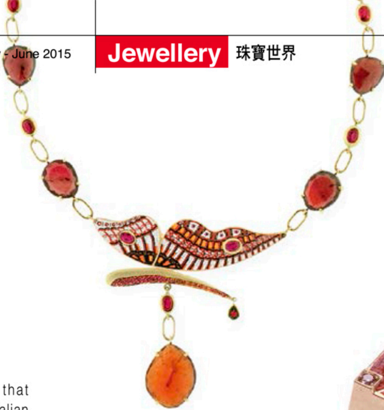
MARIPOSA NECKLACE SET WITH 18-KARAT GOLD, CORAL, HESSONITE GARNET, RHODOLITE, RUBY AND MICROMOSAIC FROM LE SIBILLE LE SIBILLE的鑲嵌18K金、珊瑚、鐵鈣鋁榴石、鐵鎂鋁榴石、紅寶石及MICROMOSAIC「MARIPOSA」項鍊