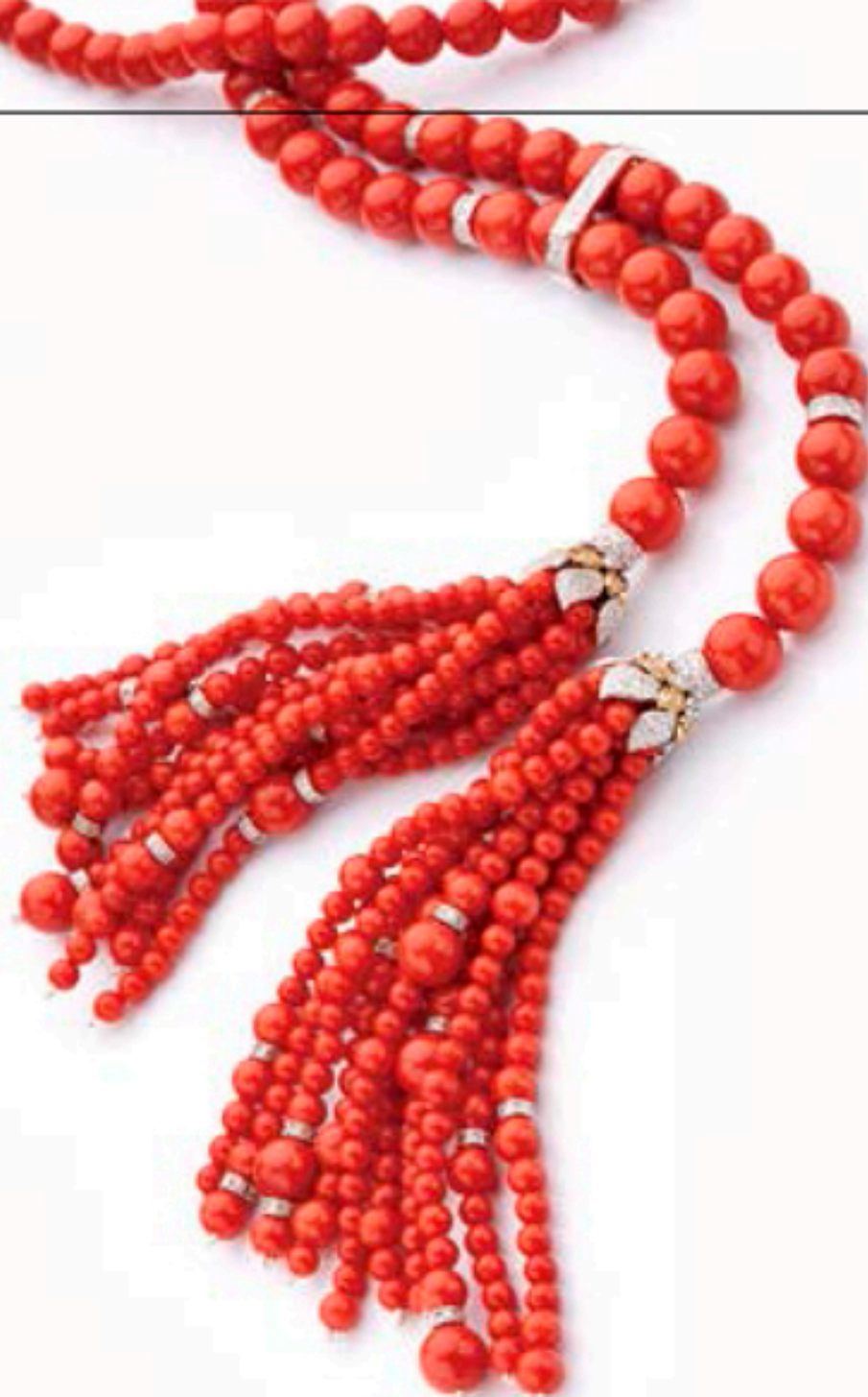
ICON COLLECTION NECKLACE SET WITH MEDITERRANEAN RED CORAL AND DIAMONDS FROM DE SIMONE DE SIMONE的「ICON系列」地中海紅珊瑚及鑽石鑲嵌項鍊

系列鑲嵌紅珊瑚和微小玻璃磚，做出不同設計，對歷史進行一種富當代和貴族氣派的詮釋。