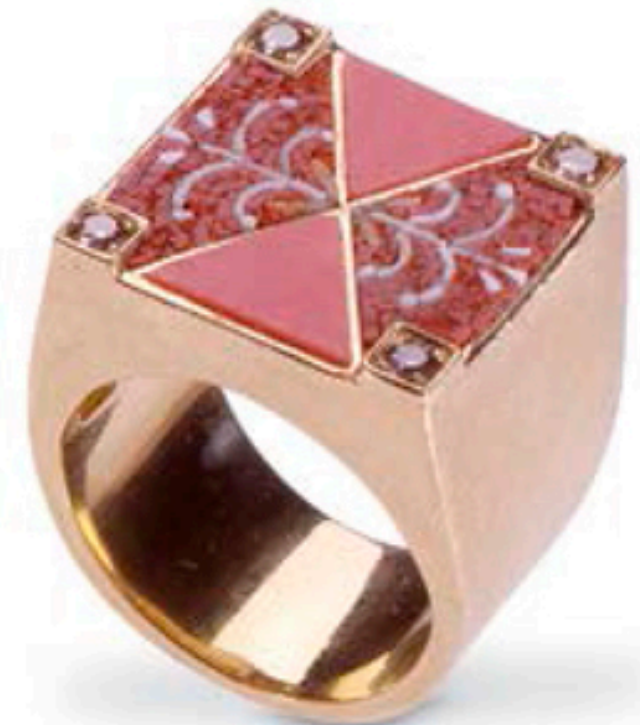
PATERNO' RING SET WITH 18-KARAT GOLD, CORAL, BROWN DIAMOND AND MICROMOSAIC FROM LE SIBILLE LE SIBILLE的鑲嵌18K金、珊瑚、啡鑽及MICROMOSAIC「PATERNO'」指環