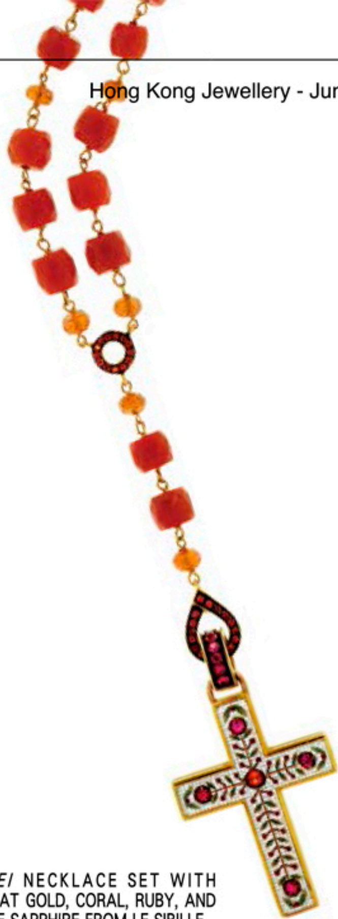
POMPEI NECKLACE SET WITH 18-KARAT GOLD, CORAL, RUBY, AND ORANGE SAPPHIRE FROM LE SIBILLE LE SIBILLE的鑲嵌18K金、珊瑚、紅寶石及橙色剛玉「POMPEI」項鍊

儘管目前珍貴珊瑚主要產自夏威夷、日本海岸、地中海、紅海，甚至世界各地，意大利仍被譽為全球珊瑚首飾的製造中心。自古以來，世界主要的珊瑚珠寶工坊便集中於意大利。意大利的歷史、文化、創意及工藝已融入珊瑚製造中，其珊瑚首飾亦因為強烈的文化象徵和傳統價值被世界尤其亞洲的消費者所認可與熟悉。